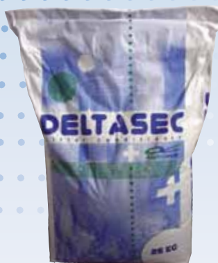
55 lbs. bag

Animal well-being improves overall results